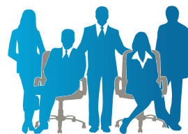
Business Support Services